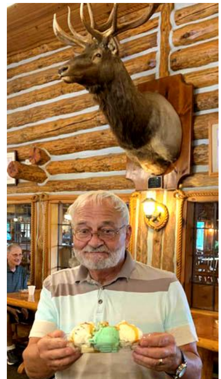
Iced Cream Banana Splits Every Night for Guests