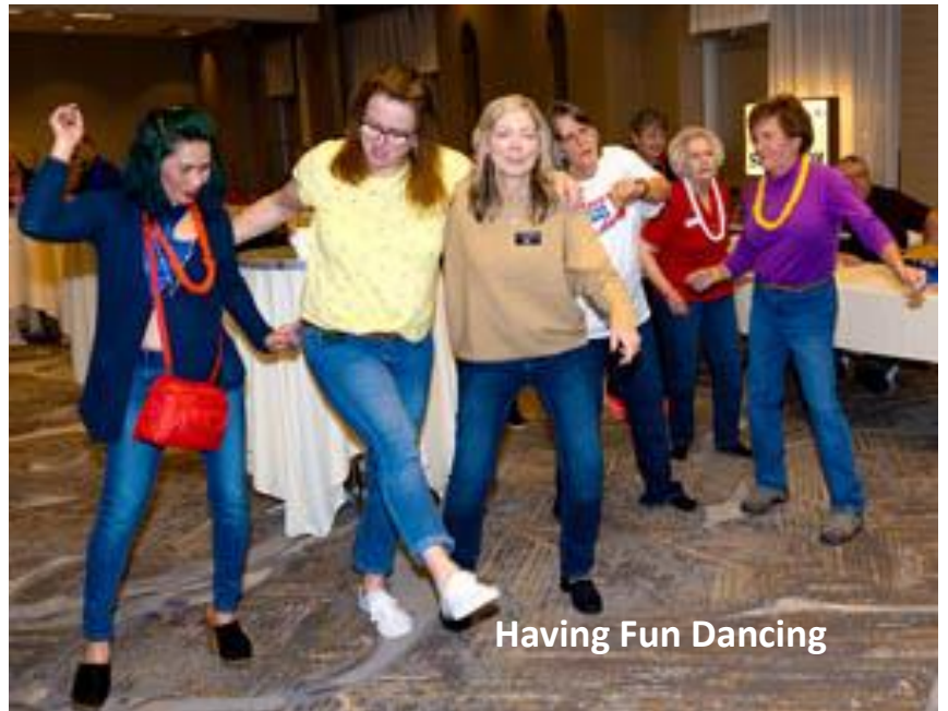
Having Fun Dancing