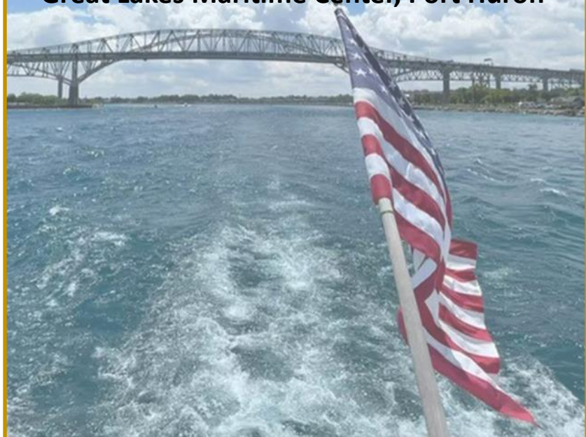
Blue Water Bridge