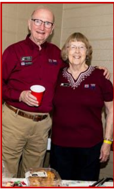
CPS-ECP Officers & (Detroit & Birmingham Members) modeling special shirts at the D9 Spring Conference Vision 2023

ABClub Annual Meeting February 6-11, 2024 Orlando, Florida