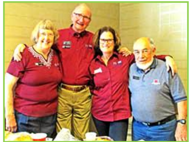
Bridge Officers, Canadian Power and Sail Squadron served hot Ham Sandwiches "Come to the AGM in Windsor and greet them."