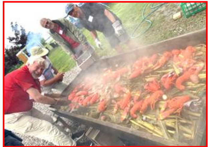
Lobster

D9 Attendees from Birmingham, Detroit, Flint, Grosse Pointe, Lansing, ST. Clair Shore and USCGAUX had a great time!