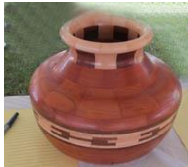
Beautiful Wood Bowl on the Auction Table